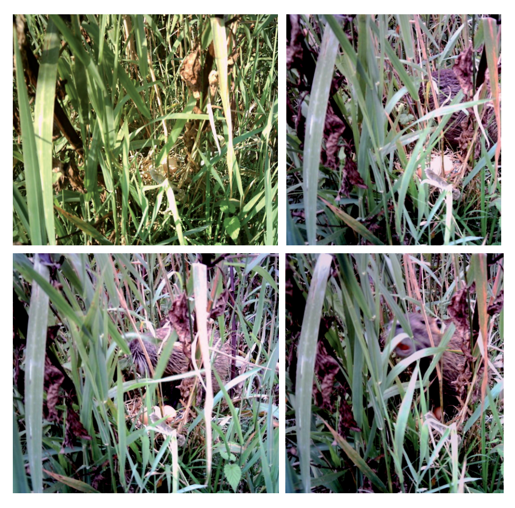
Figure 1 - A photo sequence of a coypu resting on an artificial nest and disregarding the eggs.

As a result, the eggs were often destroyed or sunk by the coypu resting on them.